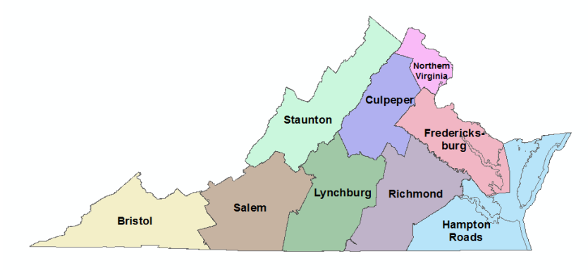
Construction District Prioritization